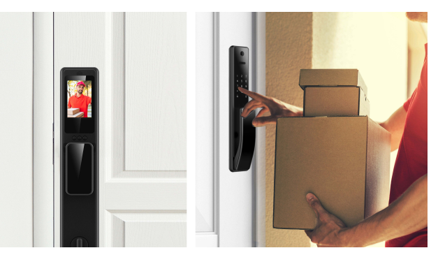
Real-time monitoring from the indoor