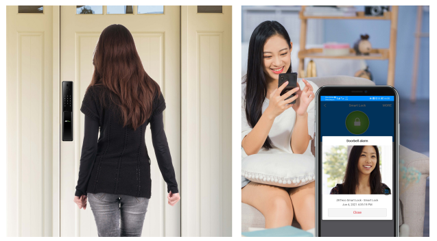
When someone presses the doorbell outside, the owner could take a look at the person through the app