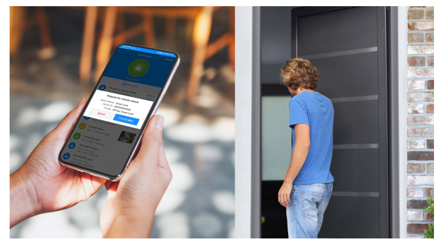
Remotely unlock using the app