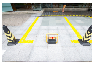
Private parking management