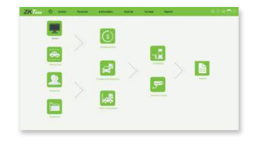
ZKParking & ZKBioSecurity